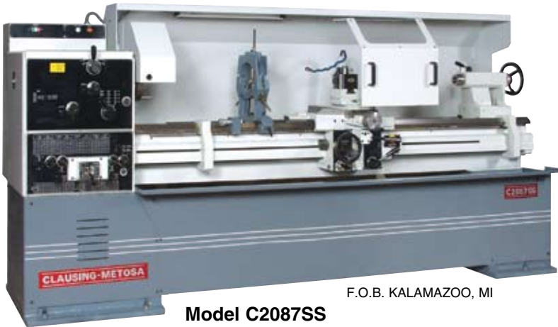
F.O.B. KALAMAZOO, MI